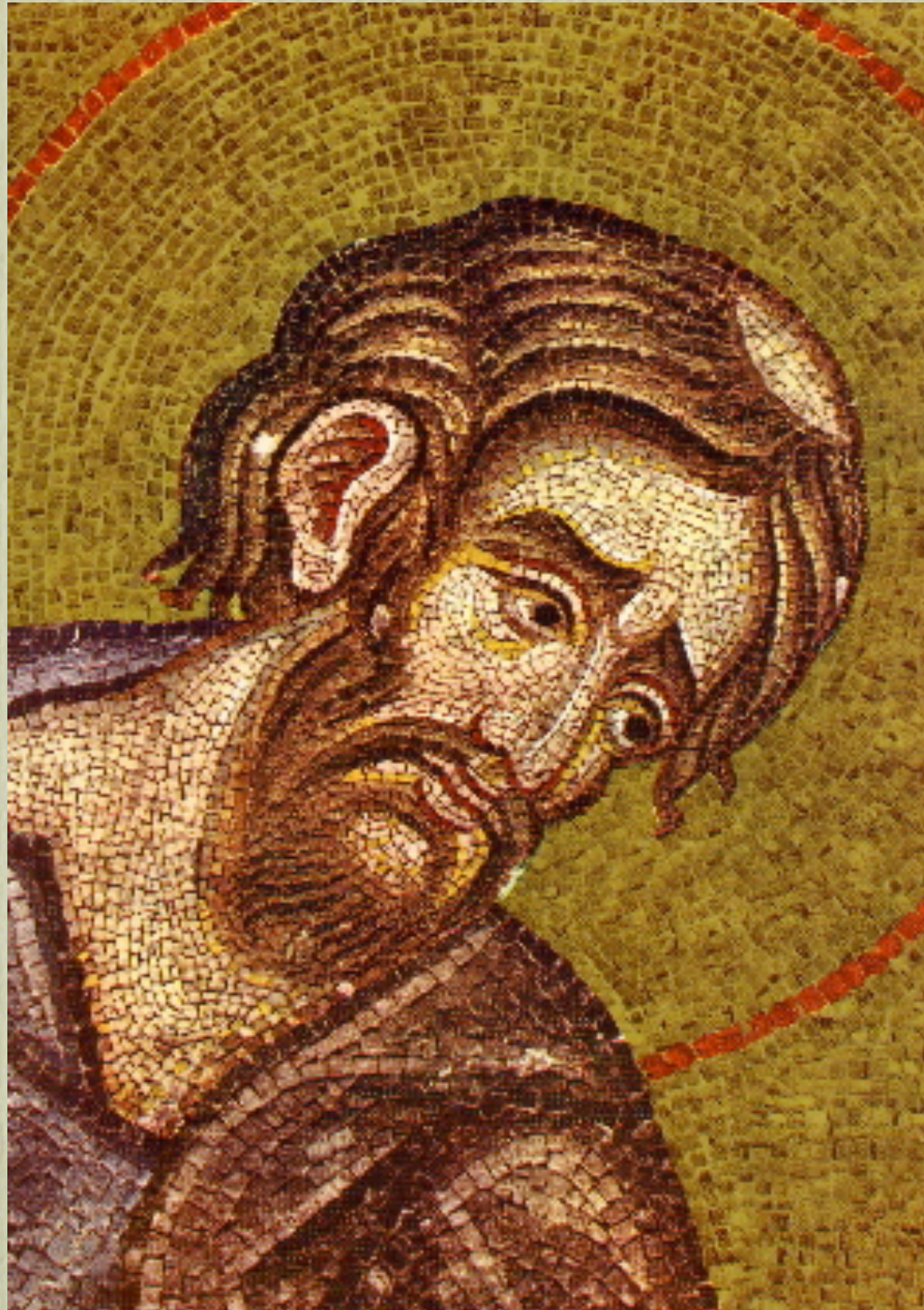
Luke (San Marco, Venice)